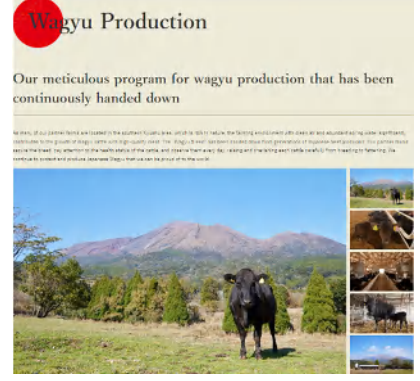
Farm introduction page