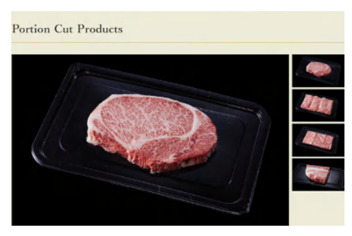
[Product introduction page]